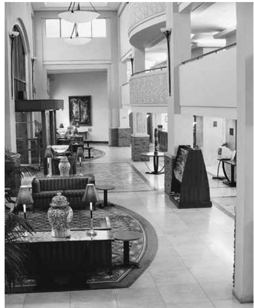
Millennium Hotel, Queenstown

The ASCIA 2005 committee has chosen Queenstown for its international reputation as a beautiful resort town. Queenstown is a world renowned skiing resort and in addition has many other outdoor facilities including hiking, jetboating, bungy jumping, etc. We would encourage delegates to attend with their families and spend some time either before or after the Meetings exploring this part of New Zealand.