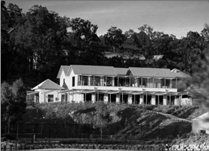
Cypress Lakes Conference Centre and Resort

We plan to have some multidisciplinary sessions with other specialists and an adjacent GP program will be run on one day.