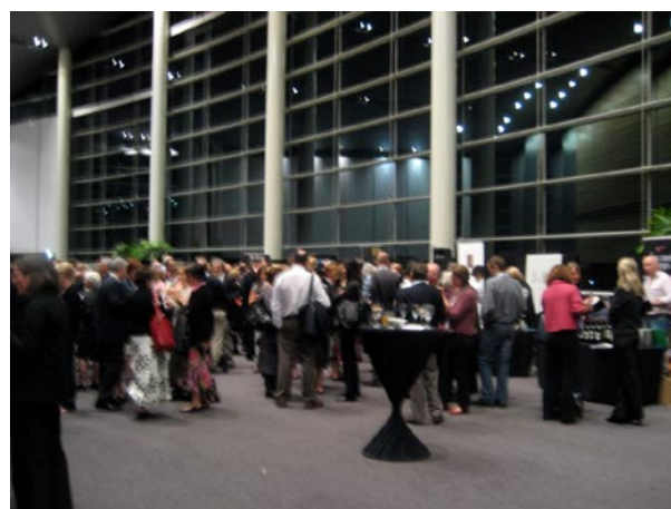
ASCIA 2009 Welcome Function Adelaide Convention Centre 15 September 2009