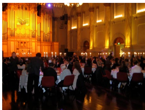
ASCIA 2009 Gala Dinner Adelaide Town Hall, 16 September 2009